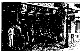
EPCOT's British area features this English pub and dining room.

Then it's lights, lights, lights. Everything is lights, unless you ride the Space Mountain coaster in the Magic Kingdom. Then it's dark, dark, dark as you climb slowly up, up to the top of the roller coaster incline and drop like a stone, screaming all the way. Yeah! The kid in you never had it so good.