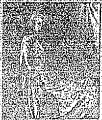
This soft, supple and wide popular shoe is actually the most durable shoe you'll see. $50. Men. Women. Children. STANLEY'S SHOE STORE.