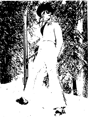
WHITE STAG calls it "Annie Oakley" and it is trimmed with suede fringe. The look of the Frontier in a waterproof ski overcoat that warms you with thermofleece insulation.