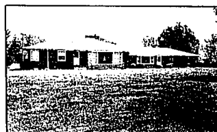
WEST BLOOMFIELD - NEW LISTING Quality built home in country-like setting on over one acre. Includes 3 bedrooms, 1 1/2 baths, family room, 3 fireplaces, central air, finished basement and attached 2 car garage. $129,900 (V-734) 851-4400