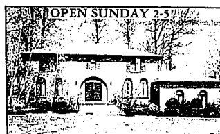
2720 HOMEWOOD - TROY North of Long Lake and East of Adams. FOUR BEDROOM colonial in one of the most PRESTIGIOUS subs this area has to offer. Sunken family room with full wall fireplace, 1st floor laundry, library. NEW APPLIANCES and MORE! $189,900 (HW-272) 557-6700