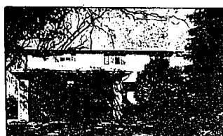
IMMEDIATE OCCUPANCY/PRICED RIGHT Exceptional FOUR bedroom, 2 1/2 bath colonial offering central air, large kitchen with pantry, formal dining room and 2 car attached garage. This home is located in a GREAT FAMILY AREA and close to schools and recreation. $91,700 (C-256) 557-6700

O&E Classifieds work! O&E Classifieds work! O&E Classifieds work!