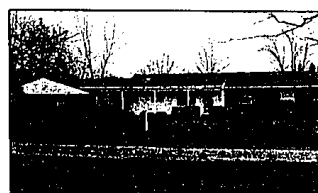
FARMINGTON HILLS Briar Hill spacious ranch on lovely large lot featuring 3 bedrooms, 2 full baths, large family room with woodburner, formal dining room, natural fireplace in living room, finished basement and attached garage. $125,700 (B-298) 851-4400