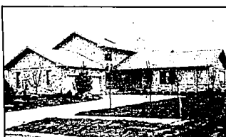
EXCLUSIVE 1987 HOMEARAMA PROPERTY Innovative double wall, super insulated energy-saving construction. Dramatic sunken family and living rooms with two-way fireplace. Many more detailed features. Must see! $209,000 (P-347) 647-6400

LATHRUP VILLAGE OFFICE 27313 Southfield Road - N. of 11 Mile 557-6700