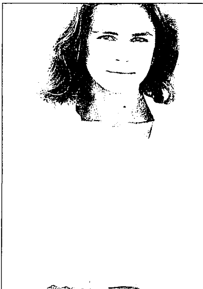
Valerie Kaprisky is Chris, a sexually provocative 18-year-old summering in the south of France, in "L'Anée Des Meduses." The French film with English subtitles is unrated.

Lots of energy and personal charisma lead to "Ishtar's" downfall. The film may not be as dull as "Hot Pursuit" and "Jellyfish," but it's close behind.