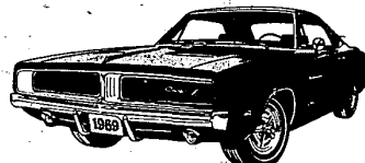
1969 DODGE CHARGER