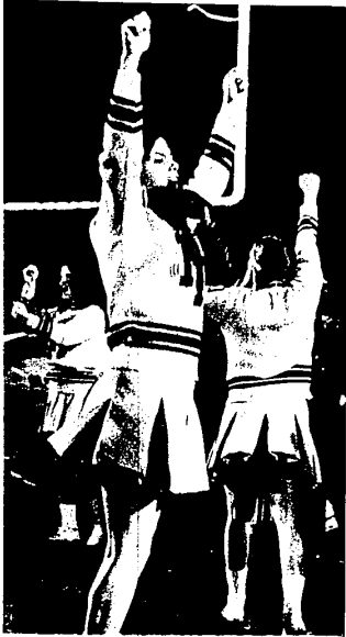
N. FARMINGTON cheerleaders let the world know how they feel about their undefeated football team. This is what happened when North rolled past Saginaw MacArthur for its eighth straight victory in the game in Saginaw.

All that now stands between North Farmington High's football team and a perfect 9-0 record is neighboring Farmington.