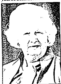
"Farmington Hills is a fine city

"Here, there is a bit more open space, hills, special valleys, century-old trees that whisper in the wind, three pioneer cemeteries carefully maintained — the things which speak to the spirit and nurture the very roots of human living.