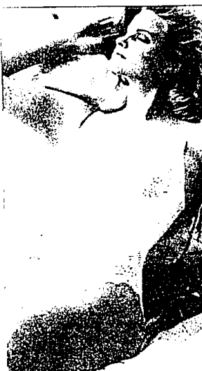
Saks Fifth Avenue

251 Merritt, Birmingham • 644-7311 • Weekdays 10-6, Thurs. & Fri. 10-9 2nd Store: 2915 Breton • Grand Rapids • 1-800-622-RUGS