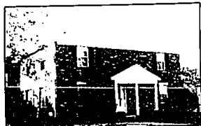
Highly desirable Fairwood Villa Condo on Great Oaks Golf Course. Neutral decor throughout the family room with wood wainscoating and additional area, Jacuzzi tub and greenhouse window in main bath. $145,000. OAD-38