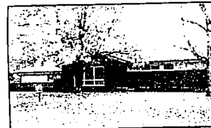
BRICK RANCH Well maintained home with newer roof, furnace and freshly decorated. Additional features include central air, fireplace, Florida room and nicely landscaped yard. Newly listed at only $99,900. GLK-21810