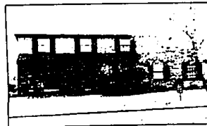
Immaculate Troy home features crown moldings, upgraded wood kitchen with Jenn-air and built-in microwave. Central air, 4 bedrooms, 2½ baths and library. Two-level wood deck partially covered. $182,900. TAA-21761