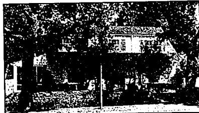
CHARMING UPDATED DUTCH COLONIAL In the Heart of Birmingham. Spacious living room, large dining room, new kitchen with eating nook and greenhouse window, family room and master suite with dressing room, private bath and Jacuzzi. Newer heated pool with terazzo deck! HAN-99198