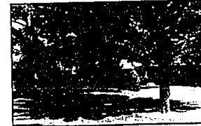
NORTH ROYAL OAK: Well landscaped treed lot enhances this well built brick ranch. Wet plaster walls, coved ceiling, hardwood floors, family room with cozy fireplace and master bedroom offers a private bath. $94,500. NOY-21847