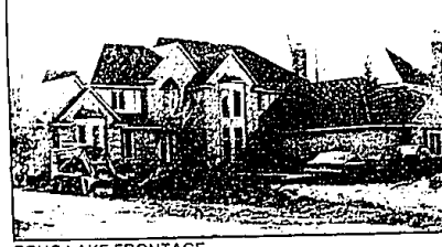
Enjoy the serene beauty of up north from the privacy of your elegant Bloomfield Tudor home. Dramatic entrance leads to a 2 story Great room, gracious family room, gourmet kitchen, 1st floor master suite and finished walk-out lower level. WAF-21838

re n, y te er ad. ely nly well r, il- ami- new chen 995 ew or circu family men OMF