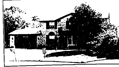
WEST BLOOMFIELD LAKEFRONT Fabulous custom built home with magnificent view of the lake. Super kitchen has ceramic tile floor, circular stairs, large wood deck, cathedral ceiling in family room, marble fireplace and walk-out basement. $234,900. BLD-96613