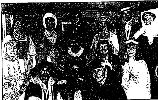
The Silver Swan Singers of East Lansing will be part of the entertainment at the Madonna madrigal dinner.