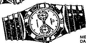
MEN'S 18K GOLD, WITH DAY-DATE AND GILT DIAL - $6,995