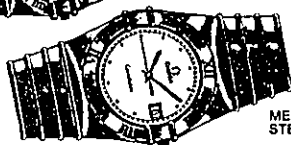
MEN'S 18K GOLD & STAINLESS STEEL, WITH GILT DIAL - $1,095