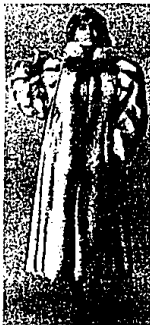
Exchange Privileges on Gifts & Complimentary Gift Wrap