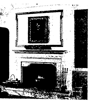
USE OF MOLDING — Careful detailing of its stock mantel makes this fireplace a unique piece of craftsmanship and the focal point of the room. The same stock pattern used for the chair rail wall application was used on and above the fireplace in a repeating design.

ALLEN LUMBER CO. 21645 GRAND RIVER (near Lahser) KE 2-0805 OPEN DAILY 8:30-5:30 SAT. TO 5 P.M. 27540 MICHIGAN (at Inker) LO 3-1600 OPEN DAILY 8:30-5:30 SAT. TO 5 P.M. BANKAMERICARD • MASTER CHARGE • INSTANT CREDIT