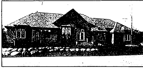
6 custom home sites in Bloomfield Township, architectural control, development by Abbey Homes and built by Roy V. Mercer Bldg. Co., easy access to expressway and shopping. From $435,000. 22816 647-6030.