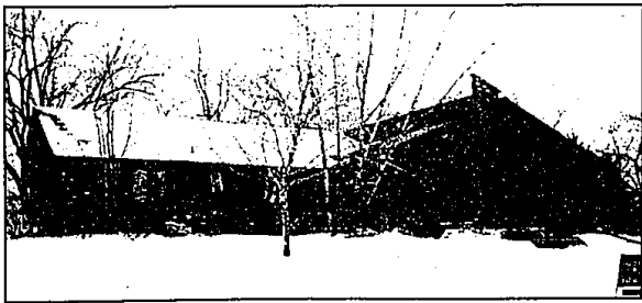
Bloomfield Hills Schools. 3 bedroom contemporary ranch on a quiet cul-de-sac. 2½ baths, fireplace, gourmet kitchen with island and doorwall to deck, 1st floor laundry, library. $248,000. 23617 647-6030.