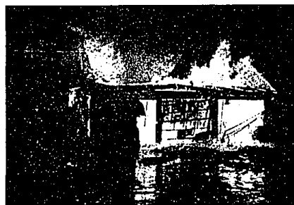
At right: Fire Lt. John Trafalet observes one of the burning garages.

This pumper is being used to supply attack crews at three of the burning houses.