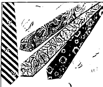
Men's ties are springing in bold new directions this season. Shown clockwise from the left are: a nautical theme stripe on woven silk fabric in shades of navy and tan; a tapestry design on woven silk fabric; a foliage motif print on vibrant red silk fabric; a European abstract theme on silk crepe de chine.

Jewelry is best for day worn at ears and wrists, pins worn in groups.