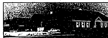
A subsidiary of St. Mary Hospital, Livonia

St. Mary Health Care Center - Northville 42000 W. Six Mile Road One mile west of Haggerty 347-1070