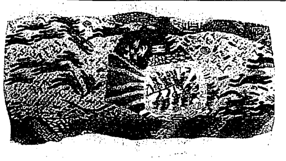
Deborah Frazee Carlson's weaving, "Inside/Photos Fish # 1," is of silk, metallic thread on industrial felt. One of the major works in the exhibit, it is 42 by 72 inches.