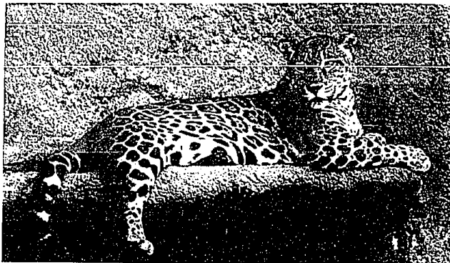
A 300mm telephoto lens enabled Monte Nagler to capture this photo of a proud jaguar in his natural environment at the zoo.