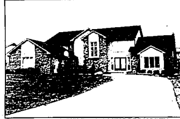
WEST BLOOMFIELD - MAPLEWOODS NORTH Fabulous contemporary with master suite, double jacuzzi, 4 additional bedrooms, formal dining room, spacious great room, marble fireplace, alarm and sprinkler system. $349,900 (P-440) 851-4400