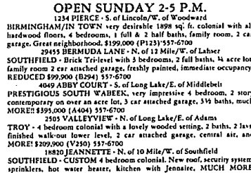
OPEN SUNDAY 2-5 P.M. 1234 PIERCE - S. of Lincoln/W. of Woodward BIRMINGHAM/IN TOWN very desirable 1898 sq. ft. colonial with all hardwood floors, 4 bedrooms, 1 full & 2 half baths, family room, 2 car garage. Great neighborhood. $199,000 (P123) 557-6700 2945 BERMLUDA LANE - N. of 12 Mile/W. of Lahser SOUTHFIELD - Brick Tri-level with 3 bedrooms, 2 full baths, 4 acre lot, family room 2 car attached garage, freshly painted, immediate occupancy. REDUCED $99,900 (B294) 557-6700 4049 ABBY COURT - S. of Long Lake/E. of Middlebelt PRESTIGIOUS SOUTH WADEEK, very impressive 4 bedroom, 2 story contemporary on over an acre lot, 3 car attached garage, 3 1/2 baths, much MORE! $395,000 (A404) 557-6700 2105 VALLEYVIEW - N. of Long Lake/E. of Adams TROY - 4 bedroom colonial with a lovely wooded setting, 2 baths, 2 lavs, finished walk-out lower level, 2 car attached garage, central air, and MORE! $209,900 (V210) 557-6700 18810 JEANNETTE - N. of 10 Mile/W. of Southfield SOUTHFIELD - CUSTOM 4 bedroom colonial. New roof, security system, sprinklers, hot water heater, kitchen with Jennaflex, MUCH MORE! $173,900 (J188) 557-6700 18151 ADRIAN - N. of 10 Mile/W. of Southfield SOUTHFIELD - 4 bedroom, 2 1/2 baths, family room with natural fireplace, finished basement, 2 car attached garage, oak floors, carpeting, new roof *86, MORE! $89,900 (A150) 557-6700 2626 MEADOWBROOK WAY - S. of 11 Mile/W. of Southfield LATHRUP VILLAGE - CHARM, 4 bedroom colonial, 2 1/2 baths, Meisculous upkeep. Cozy hearth, hardwood floor, formal dining room. A real find - don't wait! $117,900 (M262) 557-6700 840 LARCHLA - N. of Lincoln/W. of Southfield BIRMINGHAM - Picture perfect Birmingham colonial. Brick center entrance, 3 bedrooms, 1 1/2 baths. Family room. Separate dining room. New kitchen. Furnace and central air new in '87. $211,900 (L-840) 647-6400 7460 PINEHURST - N. off 14 Mile/W. of Lahser BIRMINGHAM - Spectacular 2 bedroom ranch condo. Great room with solid handmade oak floors. 1st floor laundry, library, kitchen with skylights, 2 1/2 baths, 3 car attached garage. $139,900 (P-746) 647-6400 1321 PIERCE - S. off Lincoln/W. of Woodward BIRMINGHAM - Completely remodeled. Delight in this pleasant 2 story home located on a tree lined street. Hardwood floors, 3 bedrooms, 1 1/2 baths, full basement, 1st floor utility. $189,900 (P-132) 647-6400 1274 GREENGLAN CT. - N. of Square Lake/W. of Adams BLOOMFIELD HILLS - Spaciousness and elegance describe this 3 bedroom, 2 1/2 bath Adams Woods condo in private, quiet location. Decorated in neutrals, beautifully appointed. $192,500 (E-127) 647-6400 4197 ORCHARD HILL - N. of Waukesha/W. of Adams BLOOMFIELD HILLS - Spacious ranch with 3 bedrooms, 1 1/2 baths is located in prestigious Hickory Heights Sub. Fabulous picturesque lot! Totally updated with extras throughout. $154,500 (D-149) 647-6400 31139 BELMONT CT. - W. of Southfield/N. of Thirteenth BEVERLY HILLS - Walk to swim club. Wonderful 3 bedroom brick colonial. Gracious family room with doorwall to deck. Large dining room. 1st floor laundry. Finished rec room. $199,900 (B-311) 647-6400 16020 HUMMEL CT. - N. of 13 Mile/E. of Pierce BEVERLY HILLS - Affordable ranch on private cul-de-sac. Offers 2 bedrooms, 1 bath. Family room with skylight, central air. Home warranty. Move-in condition. $96,100 (H-160) 647-6400 15593 BIRWOOD - S. of 14 Mile/W. off Greenfield BEVERLY HILLS - Delightful updated 3 bedroom brick/aluminum ranch. 1 1/2 baths. Fireplace living room. 1st floor laundry. Gas forced air heat. Attached garage. Birmingham Schools. $89,900 (B-155) 647-6400 29933 ROSEMOND - N. off Northwestern/E. of Inkster FRANKLIN - Knockout. Totally remodeled ranch with full basement. Hitch Hiker! Offering 3 bedrooms, 2 1/2 baths, super kitchen and central air. $149,900 (R-299) 647-6400 18442 WINTERSET - N. of 12 Mile/W. of Southfield SOUTHFIELD - Distinguished elegance. Energy efficient ranch with a park-like setting. 3 bedrooms, 1 bath, 2 car garage with door opener. Great family area, close to everything. $78,000 (W-184) 647-6400

NOTTINGHAM FOREST. breathtaking brick quad-level. Outstanding decor. Gourmet kitchen with best of everything, custom cabinets, garden windows, glass ceiling, all built-ins. Custom cabinetry in breakfast, family and library. Master suite. $229,900 (R-328) 647-6400