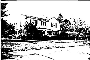
WONDERFUL FAMILY HOME Large "L" shaped family room with wet bar leading to Japanese garden. Library with fireplace, breakfast room with built-ins and bay windows, 4 bedrooms, 2 full baths and attached garage. Call for list of amenities. Located in Huntington Woods and asking $220,000. (L-841) 547-2000

Everywhere you look...you'll see one of CHAMBERLAIN REALTORS distinctive red, white and black FOR SALE SIGNS...many featuring OPEN HOUSES...just waiting for your arrival. You can't visit all the open houses we feature, but we can help make it easy for you to find the right ones! CALL OR STOP BY ANY OF OUR OFFICES OR AT OPEN HOUSES FOR A COMPLIMENTARY LISTING OF THIS WEEK'S AREA WIDE OPENS. YOU'LL BE GLAD YOU DID!