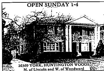
OPEN SUNDAY 1-4 26369 YORK, HUNTINGTON WOODS N. of Lincoln and W. of Woodward

Spacious 4 bedroom colonial with great floor plan. Family room with fireplace, 2 1/2 baths, screened porch overlooks inground pool. A very large home with great decorating potential. $138,000. 547-2000.