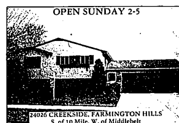
OPEN SUNDAY 2-5 24026 CREEKSIDE, FARMINGTON HILLS S. of 10 Mile, W. of Middlebelt

SPARKLING CENTER entrance 2283 sq. ft. colonial with 4 bedrooms, 2 1/2 baths, formal dining room, family room with fireplace, library and 2 car attached garage. New womanized deck. Home warranty plan Terrific home and neighborhood. $99,000 (P-296) 557-6700