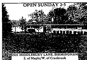
OPEN SUNDAY 2-5 2921 MIDDLEBURY LANE, BIRMINGHAM S. of Maple/W. of Cranbrook

UPDATED 3 bedroom brick ranch. 1 1/2 baths, den, fireplace, laundry. Large kitchen, thermal windows, neutral decor. Newer roof and furnace. 2 car garage. $151,900. (M-292) 647-6400