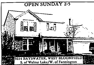
OPEN SUNDAY 2-5 5614 BAYSWATER, WEST BLOOMFIELD S. of Walnut Lake/W. of Farmington

Picturesque pond and wrap-around decking complement this colonial charmer. Family room with oak mantled fireplace, bay window in formal dining room. Lush Landscaping! $145,900. (B-561) 851-4400