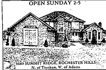
OPEN SUNDAY 2-5 HAWTHORNE HILL SUB. Just the place for a growing family. Four bedroom Tudor, island kitchen with beamed ceiling, family room with fireplace, beamed ceilings, dining room, full basement, two car garage. Move-in Condition. $259,900 651-4100