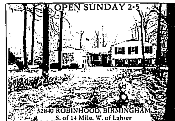
OPEN SUNDAY 2-5 32840 ROBINHOOD, BIRMINGHAM S. of 14 Mile, W. of Lahser

Picturesque pond and wrap-around decking complement this colonial charmer. Family room with oak mantled fireplace, bay window in formal dining room. Lush Landscaping! $145,900. (B-561) 851-4400