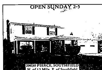
OPEN SUNDAY 2-5 79630 PIERCE, SOUTHFIELD N. of 12 Mile, E. of Southfield

Beautiful 4 bedroom colonial, 2 1/2 baths, family room, formal dining room, completely remodeled, large lot. $185,900 (L-268) 641-1660