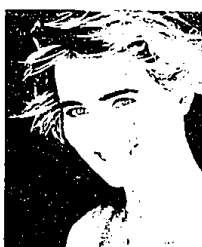
Margaux Hemingway is one of the stars of the comedy "The Women." Peter Marshall heads the cast in the musical "La Cage Aux Folles." Both attractions are coming to the Star Theatre of Flint.

Contemporary jazz greats Herbie Hancock, Chick Corea and Michael