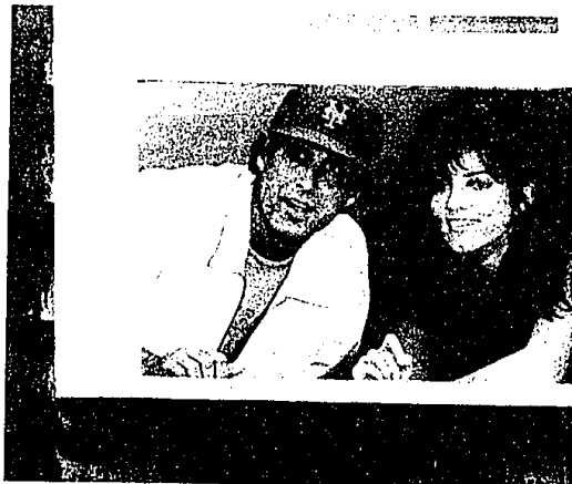
Chevy Chase and Madolyn Smith are a New York couple who leave for what they believe to be the peace and serenity of rural life in "Funny Farm."

Beverly Hills charges $53 monthly for a single full-service membership or $21 monthly for a tennis membership, plus fees of $6 to $19 an hour for court use, depending on the time of day.