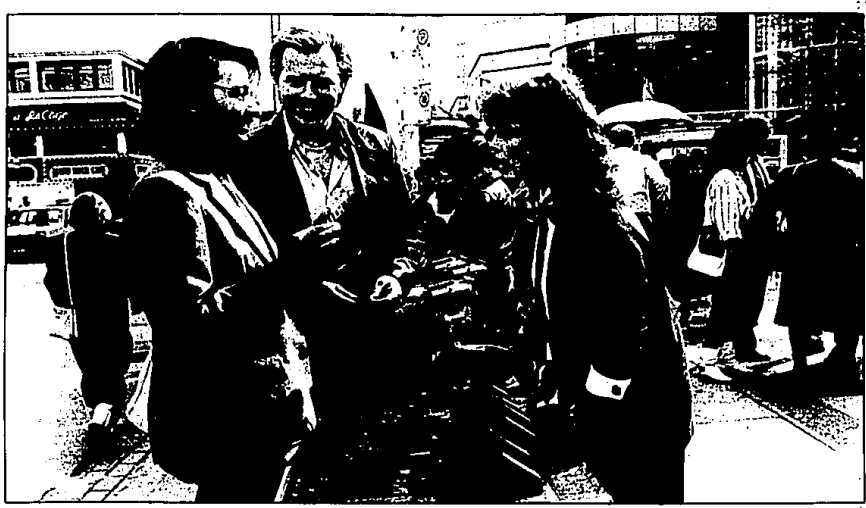
Ben Jahrlvi (Fisher Stevens) is back as the former military robotics genius who takes on a new line of work selling harmless as possible while remaining an "IT".