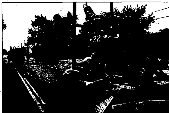
The Farmington Rockets Cheerleaders finished second in the organizational awards category for their parade float and performance.