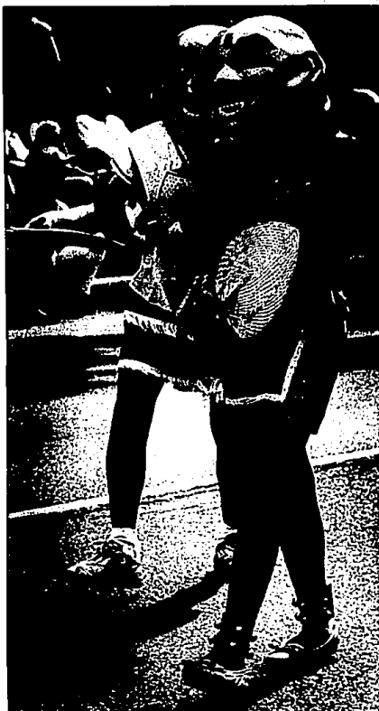
Chinese young people taking part in the Cultural Awareness Committee's parade unit sport masks native to their homeland.