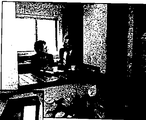
The photo to the left is a view of a finished basement leading to an enclosed walkout porch. Both are options offered by Centaur Contractors Inc.