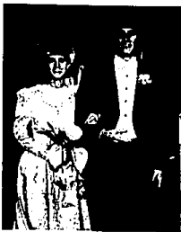
The couple received guests in Jackson Country Club before leaving on a wedding trip to Fort Myers Beach, Fla. They will make their home in Topeka, Kan.

The bride is a graduate of Michigan State University and is an elementary school teacher. The groom took his master's degree at Michigan State University and is an employee relations manager with Frito-Lay.