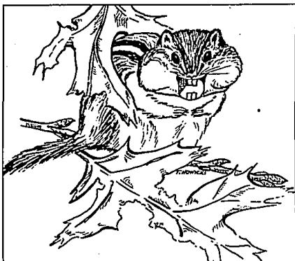
The chipmunk carried at least three medium-sized acorns in his mouth in his tree-climbing hunt.

The writer is a naturalist at Independence Oaks County Park.