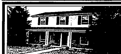
FINE FAMILY HOME Lovely colonial in popular Woodfield Village. Beautiful lot. Features 4 bedrooms, library, dining room with adjoining screened porch. Great updated kitchen with new cabinets. Spacious master bedroom. $229,900 H-34785