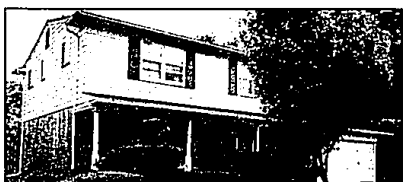
LOTS OF ROOM Lovely area of Livonia. Colonial with 4 bedrooms, 2 1/2 baths, second floor laundry, spacious living and dining rooms, privacy fence. Great family home on a spacious corner lot. $129,900 H-32772