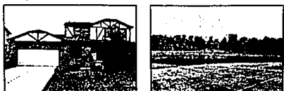
ROCHESTER HILLS Spacious colonial with private wooded setting with pond. Center stairway, library with built-ins, family room with fireplace, wet bar and walk-out to large deck, master with jacuzzi. $239,900 H-36693