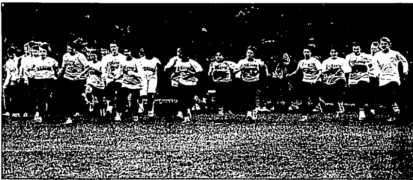
Cross country runners from Mercy and Regina high schools start out on their 3-kilometer trek Monday at Cass Benton Park.