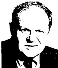
Jack Weston stars in "I'm Not Rappaport," coming to the Birmingham Theatre.

The Jewish Community Center and Nancy Garwin Productions announce the opening of the Sheldon Harnick and Jerry Bock musical "Fiddler on the Roof," at 8 p.m. Saturday, Oct. 15, in the Aaron DeRoy Studio Theatre at the Jewish Com-