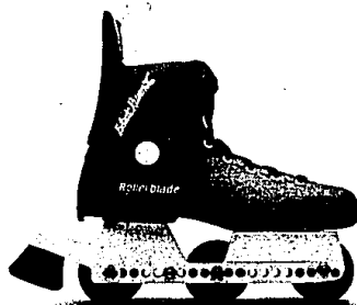
High-tech roller skates