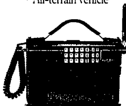
Mobile cellular phone