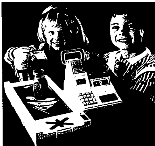
High-tech see-and-do toys keep kids busy long after the holidays. Shown here: Magic Scan Checkout.

that features a sturdy plastic outer shell, easy-to-locate controls and bright graphic accents.