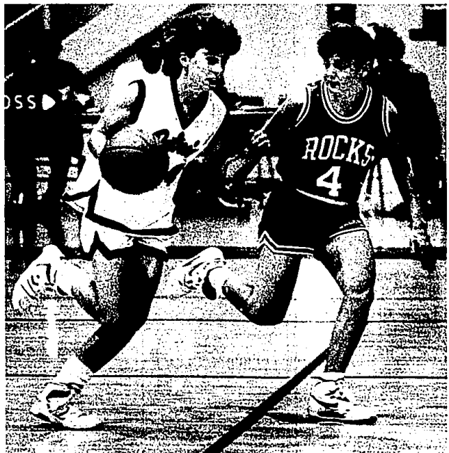
Two of the first-team performers on this year's All-Area girls basketball team are freshman