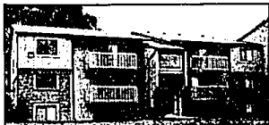
Great location in complex, this FARMINGTON HILLS Condo offers master bedroom, formal dining room, living room, walk-in closet, deck plus pool and tennis privileges. Immediate occupancy. $53,000 478-5000 07-A-1907