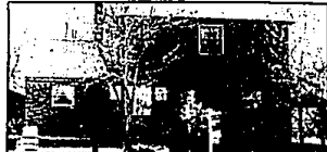
FARMINGTON HILLS Colonial is well built with 3 bedrooms, 2 baths, family room, wood floors, formal dining, deck, porch and covered patio. New oak cabinets in kitchen, plus neutral decor. $81,000 478-5000 07-B-1449