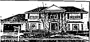
Premium FARMINGTON HILLS location. This outstanding Colonial offers updates, neutral decor, new kitchen, 4 bedrooms, 2 1/2 baths, formal dining room, family room with fieldstone fireplace, central air, dock and many amenities. $219,500 626-9100 02-B-1993