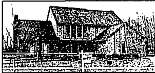
Excellent condition and quality features makes this former builders model a wonderful choice. Four bedroom Contemporary with 2 fireplaces, formal kitchen, family room, 2 1/2 baths, Berber carpeting, central air and wooded lot. $232,900 626-9100 02-B-1998