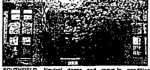
SOUTHFIELD. Neutral decor and move-in condition highlights this 3 bedroom Townhouse with 2 1/2 baths, bay window, formal dining, fireplace, patio and two car carport. Clubhouse and pool privileges. $73,900 478-5000 07-B-0988