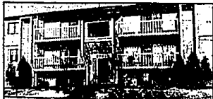
Neutral decor, excellent condition and convenient location highlights this one bedroom Condo in FARMINGTON HILLS with one bath, walk-in closet, central air, carport, pool and tennis privileges. $53,900 478-5000 07-B-2011