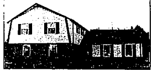
Prime FARMINGTON HILLS location! This 4 bedroom Dutch Colonial offers neutral decor, large family room with vaulted ceiling and fireplace, formal dining, library, finished basement, 2 1/2 baths, central air, patio and den/5th bedroom. $169,900 626-9100 02-B-1855