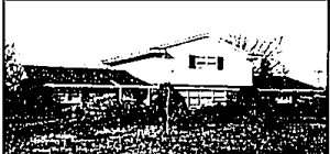
This custom built Colonial in FARMINGTON HILLS is spectacular with open floor plan, neutral decor, spacious kitchen with pantry, great room, formal dining room, full wall brick fireplace, 4 bedrooms, 2 1/2 baths and custom deck patio. Prime location. $156,000 478-5000 07-B-1928