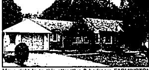
Move right in to this attractive 3 bedroom FARMINGTON HILLS Ranch with 2 full baths, great room, neutral decor, newer carpeting and multi-level decking. Large wooded lot plus porch and patio. $84,600 478-5000 07-B-1512