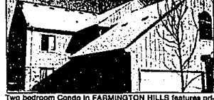
Two bedroom Condo in FARMINGTON HILLS features private location, great room, formal dining room, fireplace, kitchen with sleek bar, verticals, central air and patio. Appliances included. $119,000 626-9100 02-B-1952