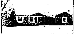
FARMINGTON HILLS. Three bedroom Ranch is charming Saturday. Features 3 bedrooms, 2 1/2 baths, patio and dock. Freshly painted. $131,000 626-9100 02-B-2000