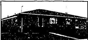
OAK PARK. Close to Providence Hospital, shopping and expressways, this 3 bedroom Ranch has 2 1/2 baths, living room, porch and basement. Freshly painted. $42,900 626-9100 02-A-1934