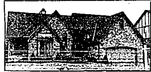
Stunning custom built executive home with prestigious FARMINGTON HILLS location offers dramatic 3 story foyer, great room, 2 fireplaces, 4 bedrooms, 4 1/2 baths, formal dining room, central air, finished walkout, patio and 3 tiered dock. $319,900 626-9100 02-B-1995