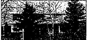
Situated on treed lot backing to commons, this FARMINGTON HILLS Colonial is newly redecorated and features 4 bedrooms, 2 1/2 baths, family room with fireplace, 1st floor laundry, finished rec room, central air, patio and inground heated pool. $159,000 626-9100 02-B-1858