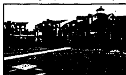
Large 2 Level Clubhouse with Pool, overlooking large sandy beach.

What we are developing at ADAMS LANDING is a homesite that leaves time and room to live your life to its fullest. The new height of elegance achieved will encompass one of Oakland county's finest communities at one of Michigan's finest beaches, formerly Sandy Beach.