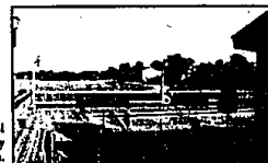
Clubhouse - Pool overlooking sandy beach.