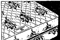
ANNIVERSARY SUPREME Luxurious comfort and firm support.