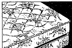
ANNIVERSARY Lasting comfort and support.