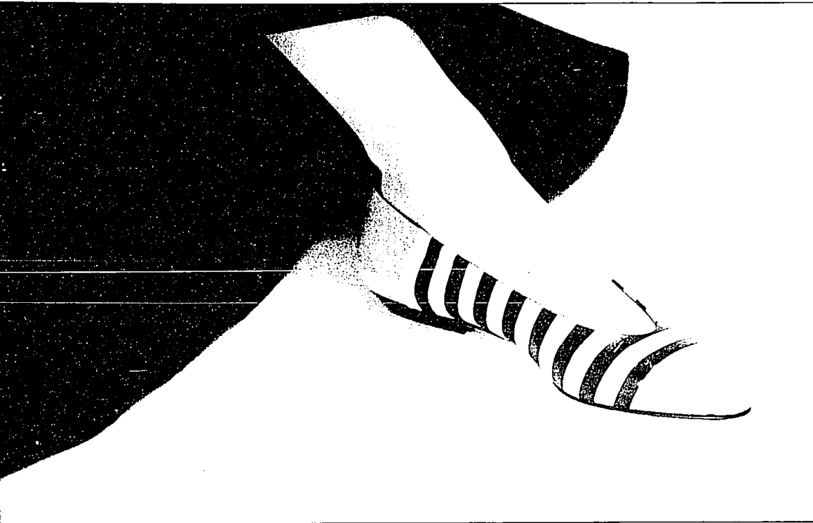
Anne Klein's multi-color striped flat, $125. Roz and Sherm.