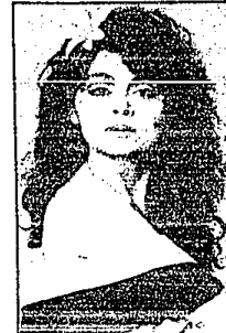
You might recognize her from the "petite flower and goddess" of Dr. Pepper ads. And you get to experience Judy Tenuta's humor when she appears at Chaplin's East Comedy Club, 34244 Groebeck, Fraser, May 17-20. For information, call 792-1902.

Sandra Bernhard will perform at 8 p.m. Saturday, May 6, at the Power Center in Ann Arbor. For information, call 423-6656.