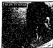
Old show business adage: If you need a hit record, dip into the Motown catalog.

Turner, an R&B singer from Birmingham — the one in England, that is — does just that on her second RCA/Jive release.