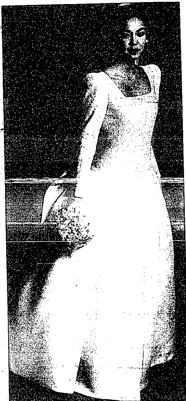
The ivory organza wedding gown with embroidered bodice and sleeves is from the spring and summer Carolina Herrera Couture Bridal Collection.

The newlyweds are now residing in Livonia.