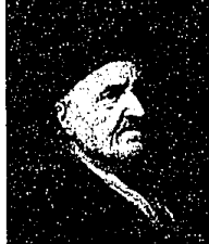
KPM PORCELAIN PLAQUES, PAIR, SIGNED F. WAGNER, WIEN, IN BRONZE AND AUSTRIAN PORCELAIN AND ENAMEL FRAMES, PLAQUES 17" x 19"

NOW ACCEPTING CONSIGNMENTS FOR UPCOMING AUCTIONS