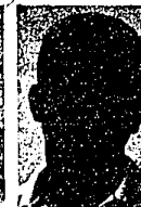
Tiber Patterson Redford CC