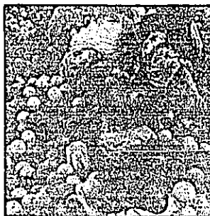
Tots swim through a sea of plastic balls in the plastic ball event at Kids Day.