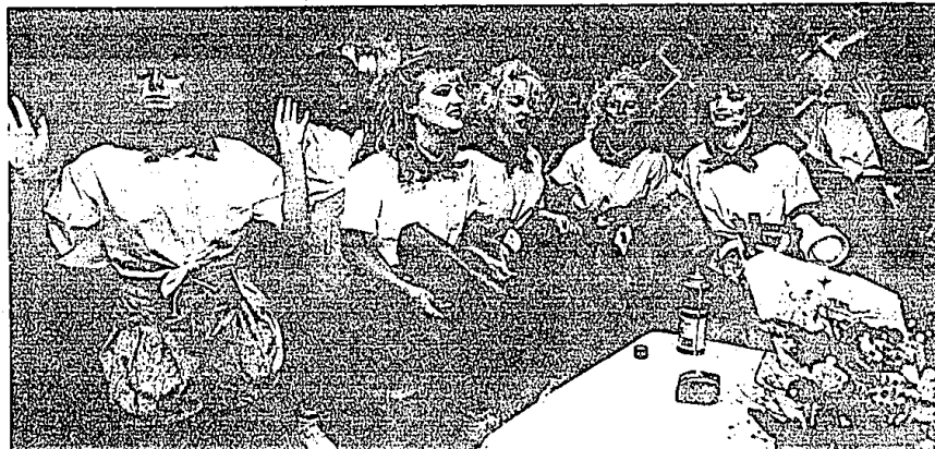
A look back stage finds the contenders in various stages of rehearsal for their opening number. The cowgirl costumes are in keeping with the theme for this year's Miss Farmington