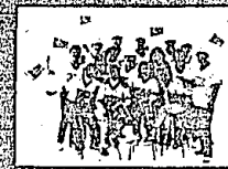
THE ROSS MORTGAGE TEAM

your mortgage commitment is instantly carved in stone!