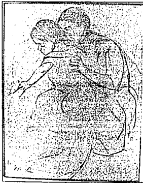
Pencil drawing, circa 1801, by Mary Cassatt is titled "Baby with Left Hand Touching a Tub Held by her Nurse."