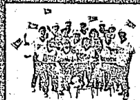
HYPEROS MORTGAGE TEAM

your mortgage commitment is instantly carved in stone!