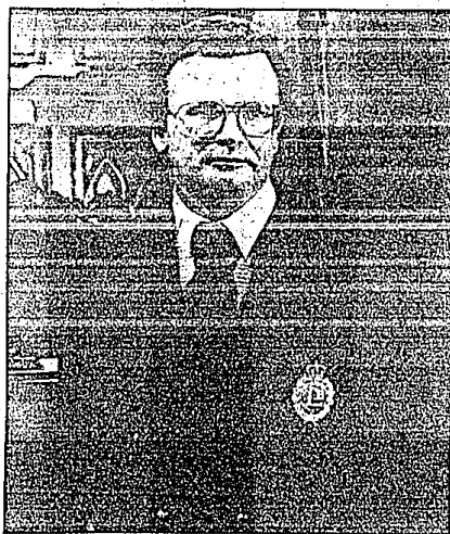
Charles Nelson Reilly is director of "Driving Miss Daisy," which will begin a national tour following its Birmingham Theatre engagement opening Tuesday, Sept. 19. For ticket information, call 844-3533.

The Executives Big Band, "The Big Band from Birmingham," will wind up the last of Birmingham's 14-week "In the Park" series of summer concerts at 7:30 p.m. Thursday, Sept. 7, in Shain Park. Featured will be hit tunes from Glenn Miller, Tommy Dorsey, Benny Goodman and Woody Herman, as played during the big-band era. An area for dancing