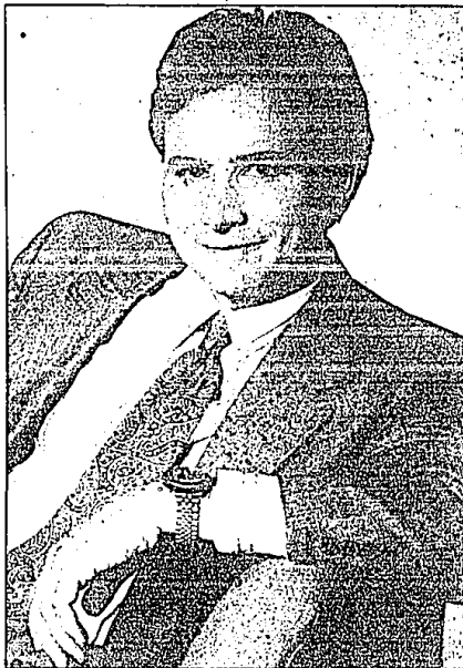
Comedian Wil Shriner can make people laugh, but his arsenal includes work in acting, filmmaking, producing, and film editing.

Born in New York City, he moved to Fort Lauderdale at age 7, because his father sought a small city environment for his children. Herb Shriner and his wife, Pixie, were killed in an automobile accident and the twins and their sister finished high school in a suburb of Dallas